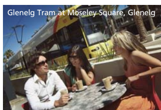
Glenelg Tram at Moseley Square, Glenelg