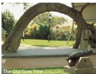
The Old Gum Tree

Walk the Proclamation Trail through the streets of Glenelg to discover some of the areas most significant sites, including the Town Hall, the landing site of the first settlers on the foreshore, the Old Gum Tree and through the streets of the original township of Glenelg.