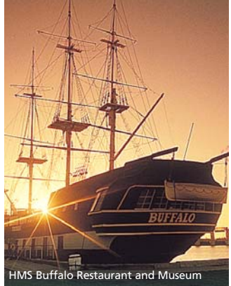
HMS Buffalo Restaurant and Museum